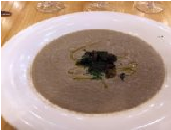
Cream of Mushroom Soup

It is now my newest favorite, and the Bread Pudding will appear near the top of my Best Bread Pudding List. More dishes: