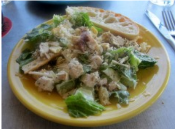
Chicken Caesar Salad