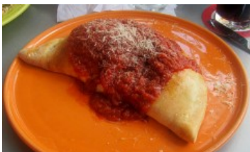
Calzone #6, Salsiccia

This bubbly piece of perfect pesto pizza is so good that it deserves an elevation to my gourmet pizza category. When you don't want meat, this is for you. It hits the spot. And the Pilsner complements the pizza. Wow.