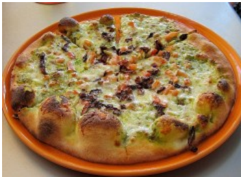
Pizza al Pesto

This is as good as (or even better than) some of the Caesars served in some fancy places. Crisp and tasty, and not a hint of sogginess. She loved it.